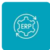
Fully Integrated ERP Solution