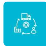
Supply Chain Management