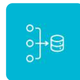
Single Source of Truth